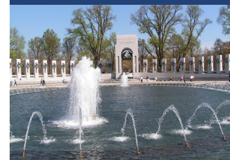
World War II Memorial